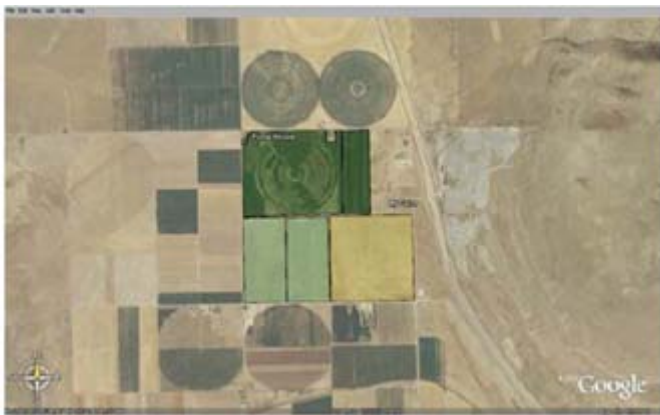
Google Earth Plus and Pro versions include drawing tools and allow you to download GPS points.

Because of the cost of software licenses, full-blown Geographic Information Systems (GIS) are out of reach for most agricultural producers. However, some of the same benefits are now available over the Internet, often times without cost. Some of these viewers are NASA World Wind, Google Earth (was Keyhole), MSN TerraServer and MSN Virtual Earth.