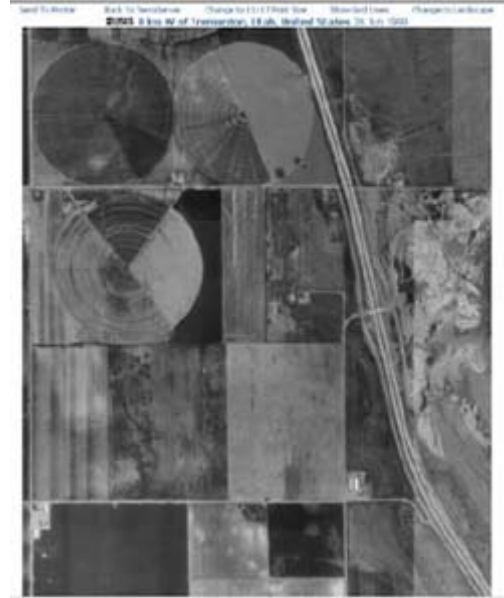
Example of MSN TerraServer with map, which uses USGS 1-meter ortho photos. Photo taken 6/26/03.